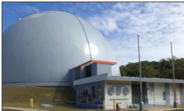
The BONUS Site Reactor Dome Was Repainted in 2014

PREPA will conduct quarterly and annual surveys to assess radiological conditions throughout the BONUS site. Results of the surveys will be available to the public and government agencies. PREPA also will conduct quarterly visual