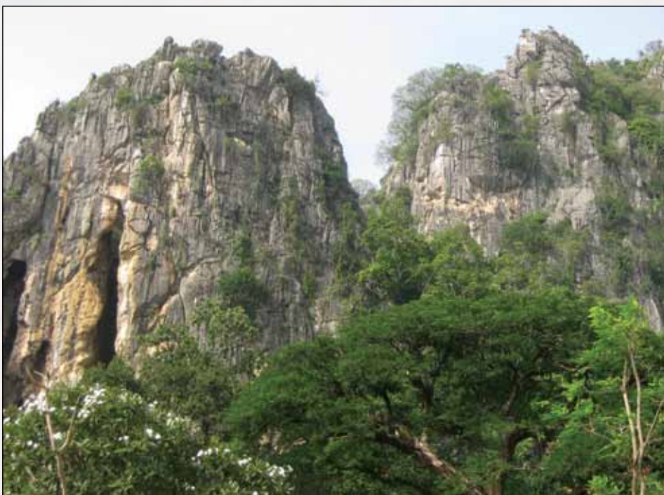
Vertical limestone beds forming cliffs along Three Pagodas Fault Zone, near Hua Hin, Thailand.