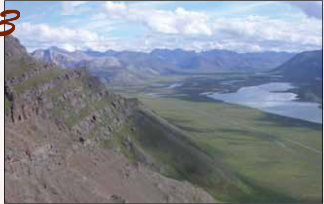
1, Icebergs immediately offshore from Ilulissat, Greenland; 2, Snowy peaks and muddy tidal flats of Cook Inlet, south of Anchorage, Alaska; and 3, Valley of the Atigun River with the Trans-Alaska Pipeline near Galbraith, Alaska.